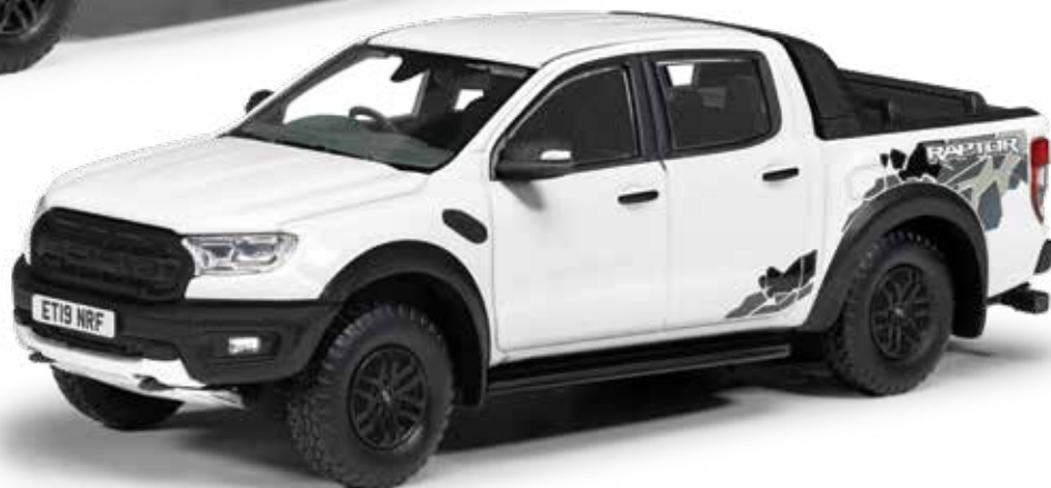
VA15203 Ford Ranger Raptor Frozen White

Arguably the most eye-catching pick up truck on the roads of the UK, the Ford Ranger Raptor is the top of the line model of the Ranger family, built for both sportiness and practicality.