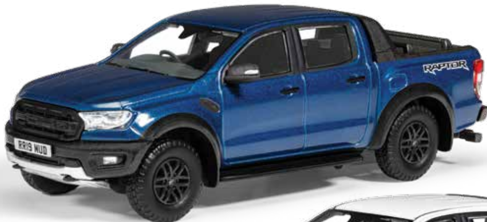
VA15201 Ford Ranger Raptor Press Vehicle Ford Performance Blue

AVAILABLE NOW | Length 126mm | Limited Edition